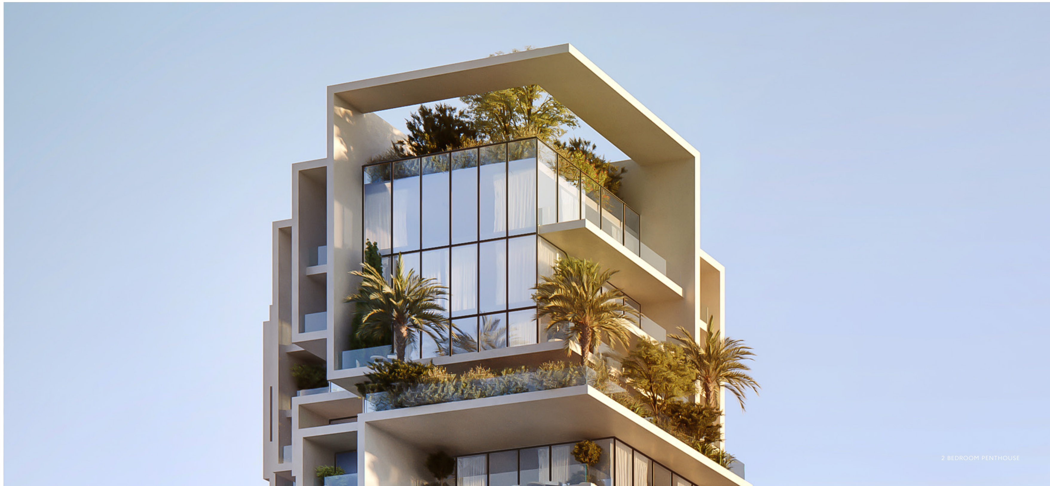
2 BEDROOM PENTHOUSE

FROM WELL APPOINTED APARTMENTS TO LUXURIOUS VILLAS, MASA RESIDENCE TRANSFORMS YOUR DREAM OF OCEANFRONT LIVING INTO A SPLENDID REALITY