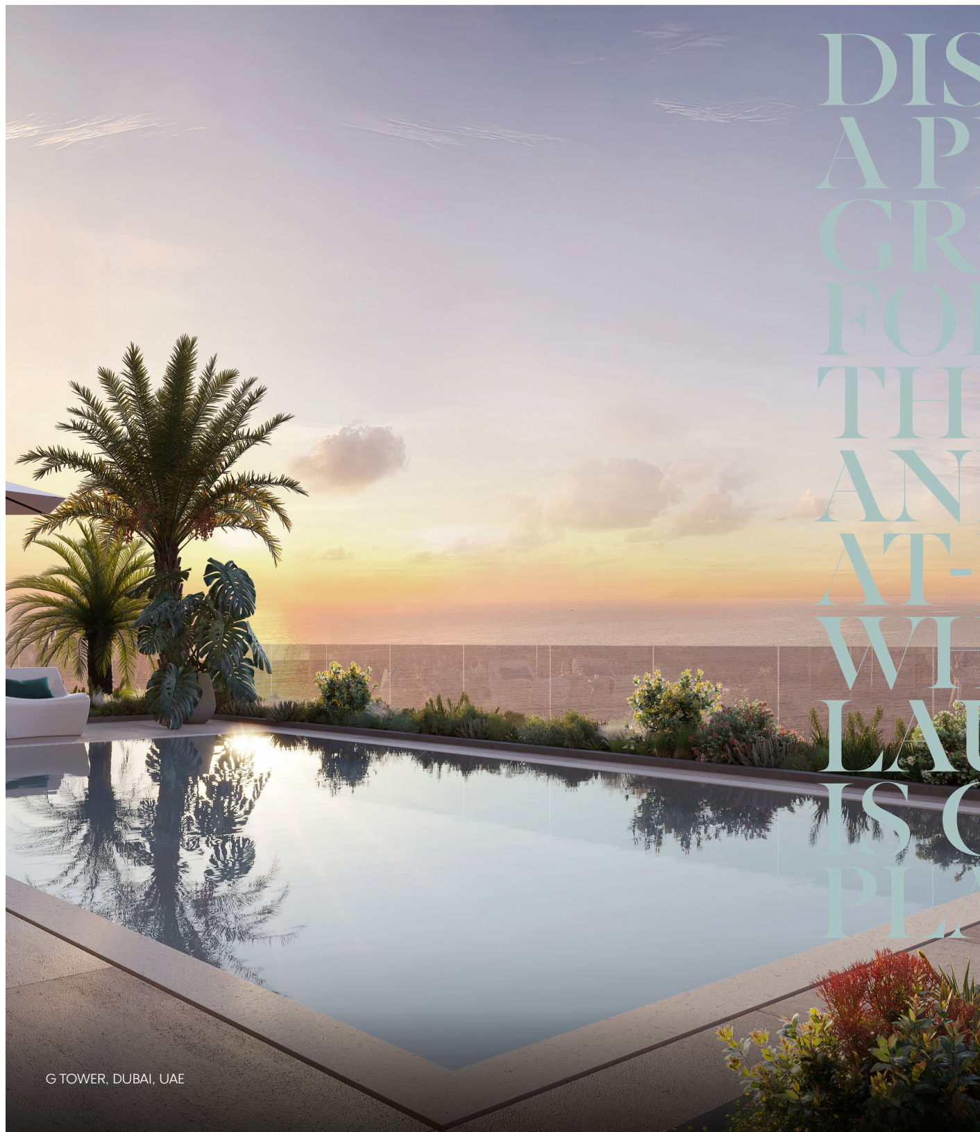
G TOWER, DUBAI, UAE